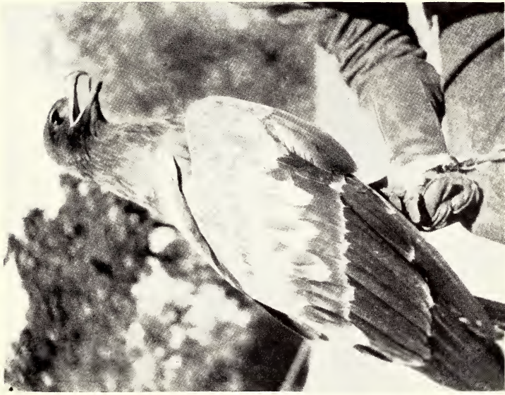
THE EASTERN STEPPE-EAGLE ( Aquila nipalensis nipalensis )